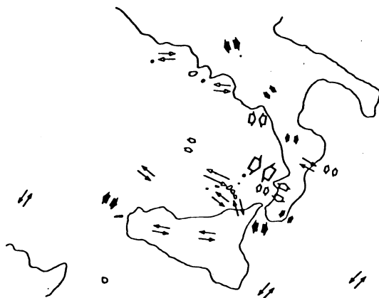
Figure 3.- Schematic stress pattern of the Calabrian Arc and surrounding regions. Open and closed symbols represent stress and strike slip of preferred fault orientation for deep-intermediate and for shallow earthquakes respectively. The size of symbols is proportional to the number and reliability of fault plane solutions.

basin may represent a remnant of the ancient Tethys, there is a general agreement that the basin is a young foundered area with oceanic characteristics. The main disagreement among the authors concerns the dynamic model. Four models will be discussed here. 1) Oceanization and foundering of a continental stable belt (Van Bemmelen 1969, Morelli 1970, Selli and Fabbri 1971, Selli 1974). This model, with some minor variants (Wezel 1978, Savelli and Wezel 1979) does not give satisfactory explanation of the magmatic activity (e.g. contemporaneity of the anatectic activity in the northern Tyrrhenian Sea and tholeiitic volcanism in the central bathyal plain; presence of the calc-alkaline Aeolian islands in the south-western corner of the basin), nor of the deep focus earthquakes in the Southern Tyrrhenian Sea and of the split of the Alpine chain whose remnants are today preserved in Corsica and in Calabria on the opposite sides of the basin. This last problem is bypassed by Wezel (1978) who hypothesizes, without any evidences, two branches of the Alpine chain bordering the Tyrrhenian Sea.