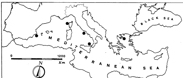
Fig.2. Distribution map of A. ogdeniae in the Mediterranean (from Spain and Corsica reported as A. antillanum ).