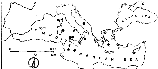
Fig.1. Distribution map of C. pelagosae (●) and C. barbatula (★). The record of C. pelagosae from Corsica is doubtful.