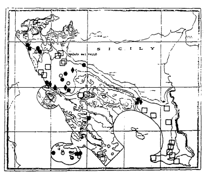
Fig. - Occurence of S.unicirrhus in the different seasons

also MANGOLD'S opinion (MANGOLD-WIKZ, 1963) that 3. unicerrals is universely to undergo substantial migrations. The observed distibutional variations in the present case are more likely to be related to the sampling "noise" and to the multispecific aims of the research program. Taking into consideration the observed difficulties in the sampling procedures and the problems related to the "interpretation" only mark and recapture experiments would give a satisfactory answer about the existence of a migratory behavior for Scaerqus unicirrhus.