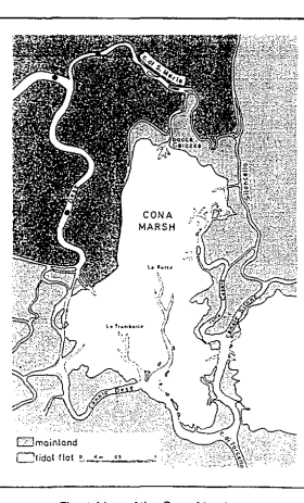
Fig .1 Map of the Cona Marsh

behaviour and circulation are often quite difficult to evaluate because of the presence or numerous tidal channels and the complexity of the morphology. Starting from a general investigation on the yearly pollutant load variations of the eight main tributaries (BERNARDI et al. , 1986), a representative test-area for the study of the behaviour of discharged heavy metals was chosen in correspondence of the estuarine system of the Cona Marsh (BERNARDI et al. , 1988). This marsh (Fig.1) is directly interested by the Dese River and for its hydrodynamical and water chemical-physical characteristics - is one of the more complex sub-areas in the Venice Lagoon. During the last five years, field