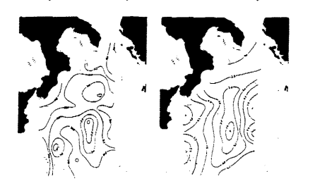
Fig. 3 : Dissolved oxygen (left) and nitrate (right) at 300 m

c) the wide layer between 500 and 2.000 m with th minimum oxygen content and the ighest nutrients content, whose extension is the widest at the depth of 1.000 m where the vater body spreads over the eastern half of the basin; d) at last, the bottom layer influenced by the Adriatic waters and by the bottom circulation.