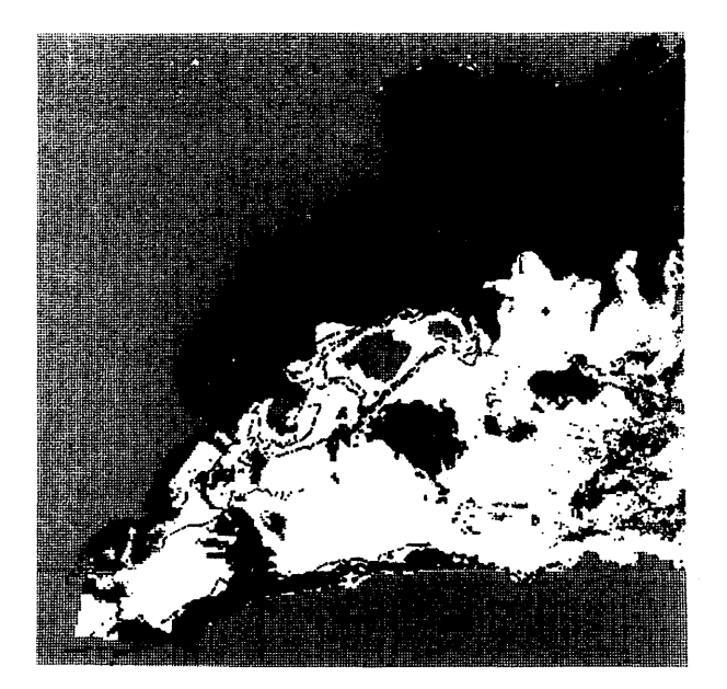
Fig. 1.- sea surface temperature of the Balearic and surrounding basins on 3 February 1990 derived from AVHRR NOAA

* Dep. Geografia, Univ. VALENCIA ( Spain ) ntre Oceanologie de Marseille, LA SEYNE ( France ) * Inst. Ciencies del Mar, BARCELONA ( Spain ) Centre