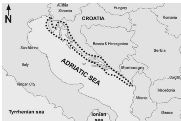
Fig. 1. Map of the monitoring coastal area.

For the evaluation of a possible hazard from the pollution of the area of Adriatic with PCBs and DDTs, investigation of fish and mussels is implemented since 1972 [2]. The long-term monitoring of chlorinated hydrocarbons in mussels was carried out along the coastal waters of the east Adriatic [Fig 1]. In this region significant quantities of wastewater are discharged directly into the sea from the coastal regions, which are densely populated and have well-developed industrial and marine activities. Also, tourist population increases significantly during the summer period, raising the basic organic load and various pollutants.